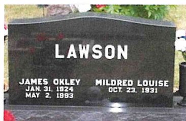
Added by RWCNAC